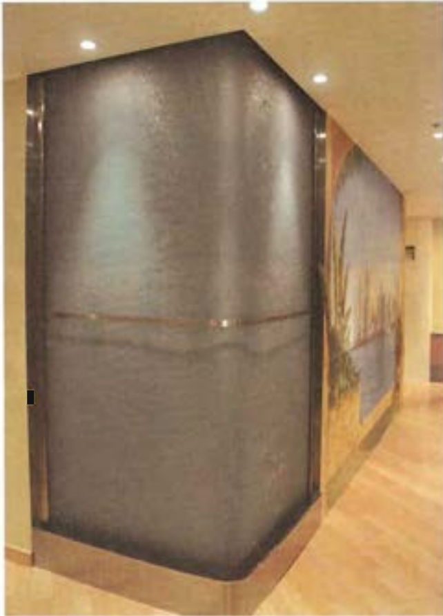
..... New technologies allow for changing LED lighting and water flow at the touch of a button.

Some manufacturers sell prefabricated units for less, but homeowners should compare the quality of materials and check the warranty that's offered. Also, find out if your purchase includes a maintenance plan. Large water features like these require regular cleaning and disinfecting, and will need their water levels topped up.