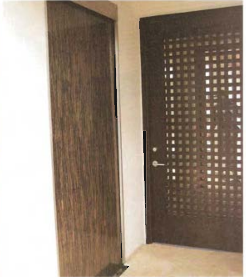
..... If buying a pre-fabricated water unit, make sure it is built with high-quality materials and comes with a good warranty.

And who says you can't have a beautiful water feature in your bathroom? Try a wall- or ceiling-mounted filler for the tub instead of a traditional spout, for a falling stream of water that looks and sounds lovely. The fillers manufactured by Kohler can be installed with a soaker tub surrounded by a deep reservoir to drain the steady