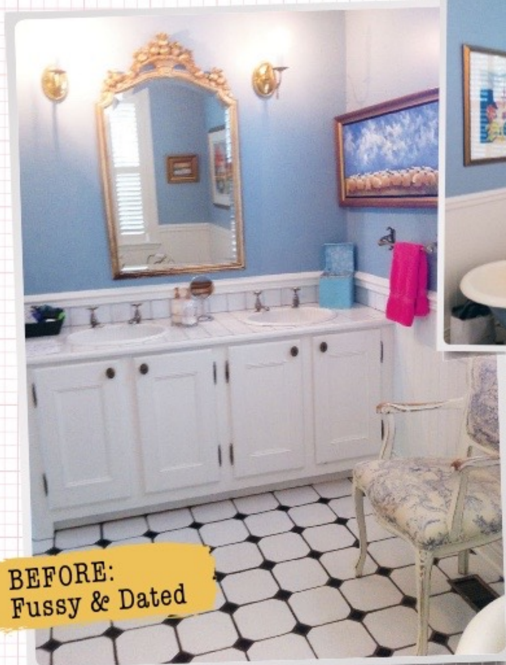
BEFORE: Fussy & Dated