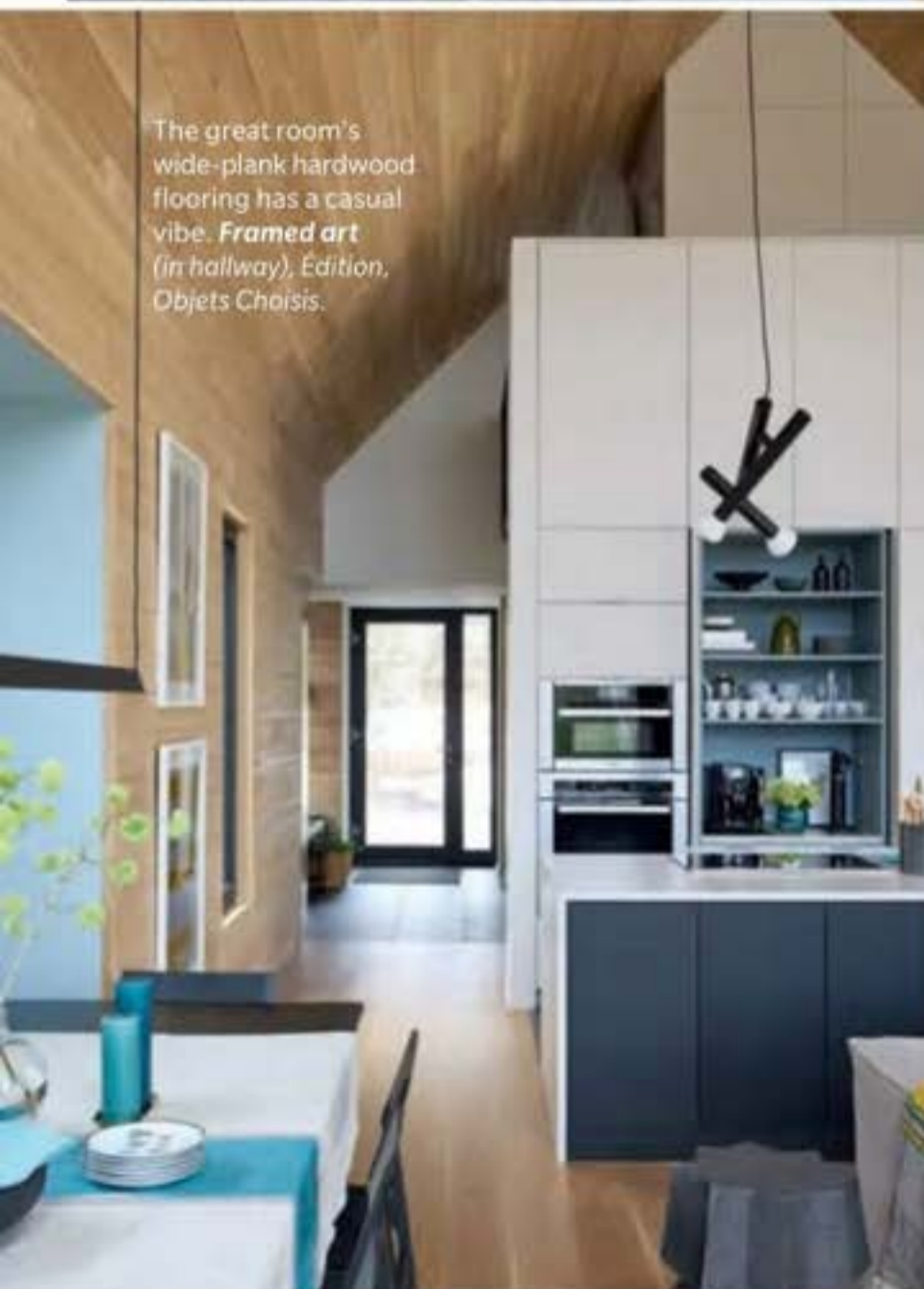
The great room's wide-plank hardwood flooring has a casual vibe. Framed art (in hallway), Edition, Objets Choisis.